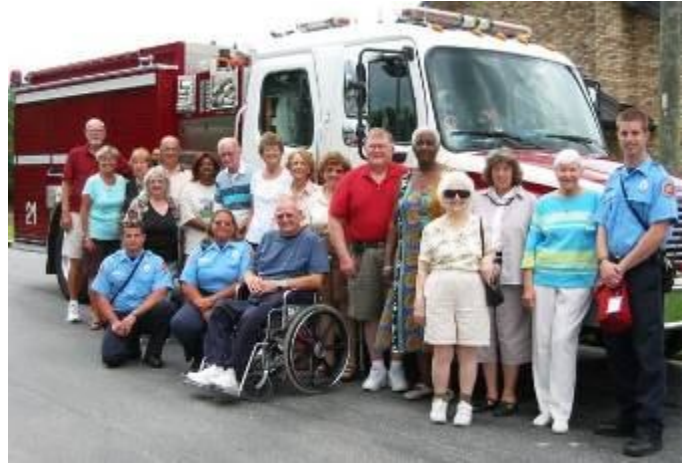
Chapter 2279, Southwest Marion County with members of the Marion County Fire Rescue after a very informative and helpful Home Safety presentation.